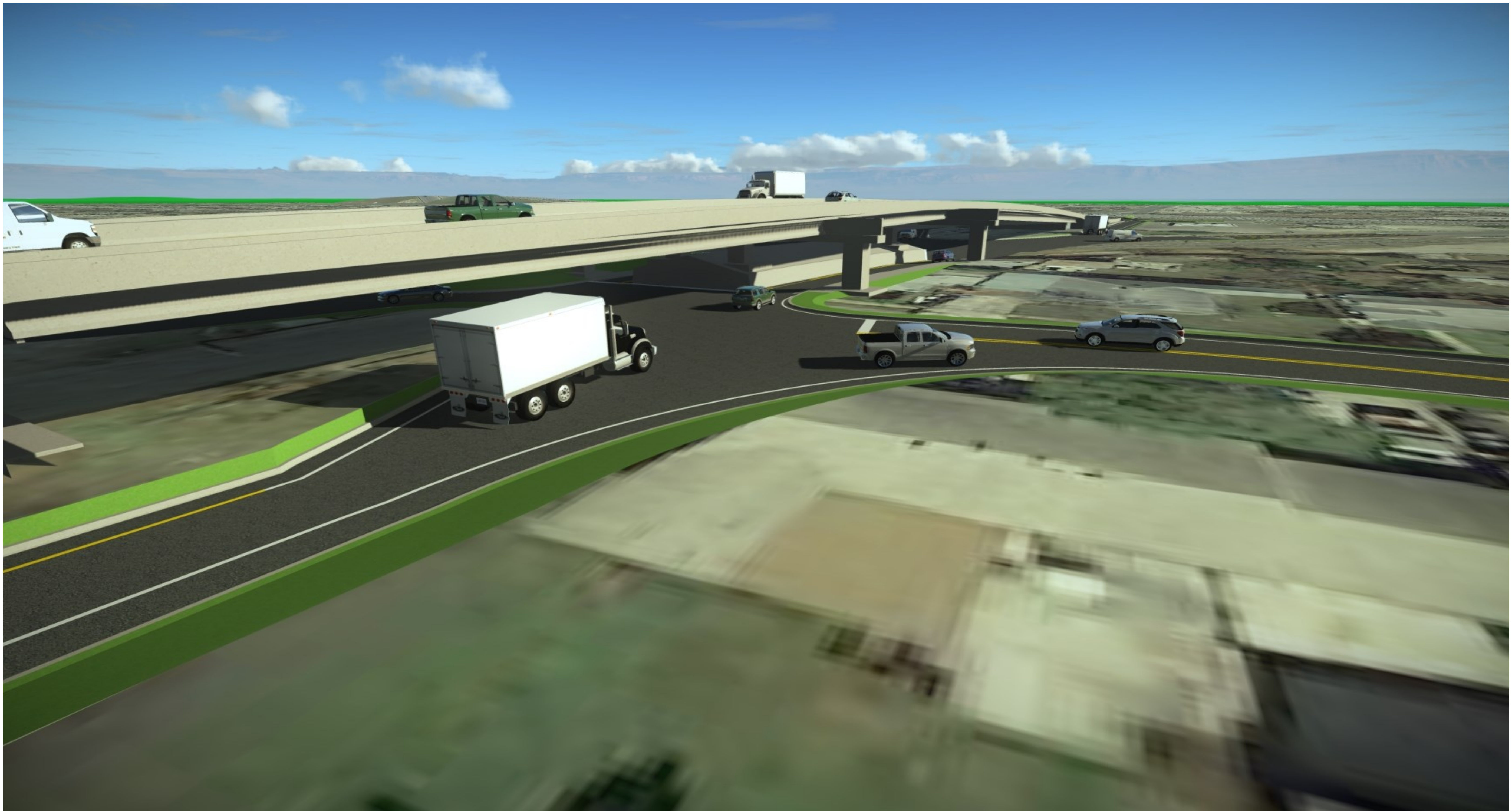
BY PASS OPTION 3 - POTENTIAL ROADWAY & OVERPASS LAYOUT