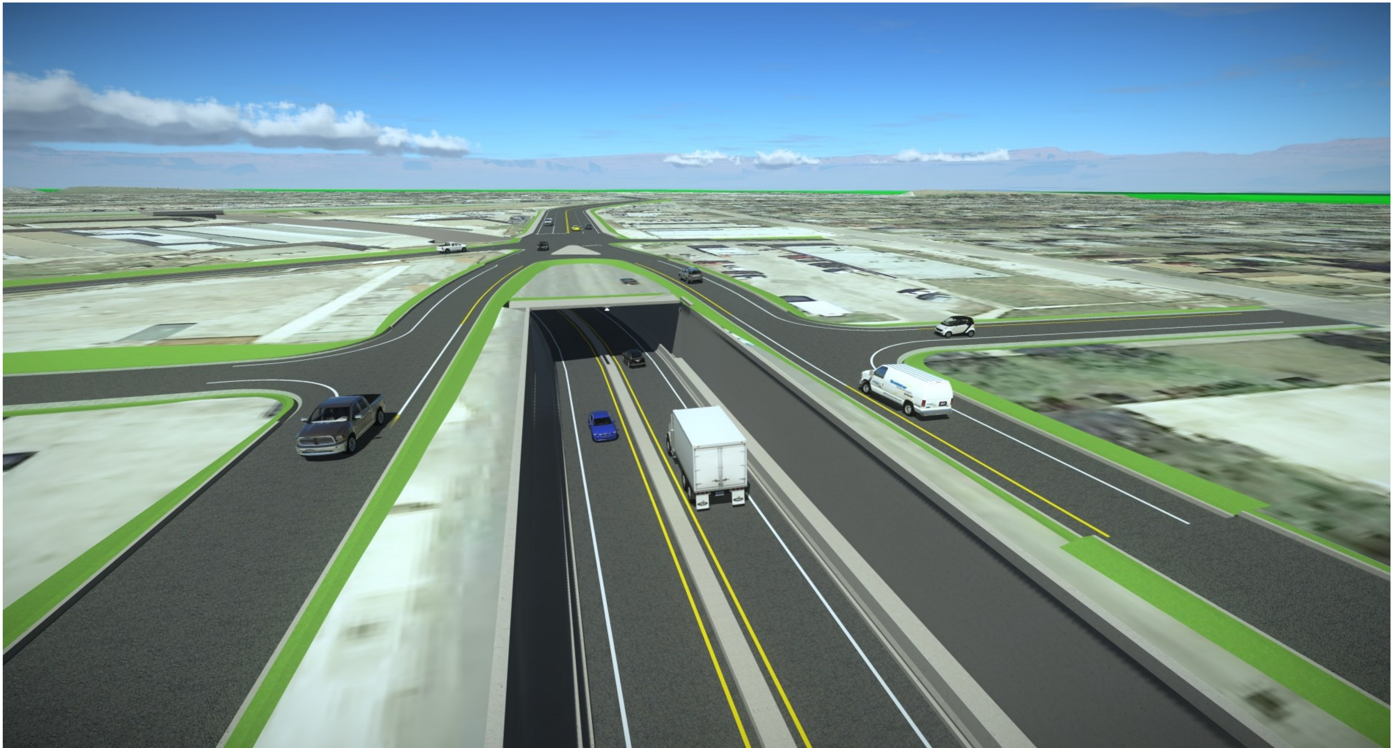
BY PASS OPTION 2 - POTENTIAL ROADWAY & UNDERPASS LAYOUT